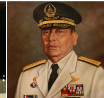
Gen Arnulfo Acedera Jr AFP (Ret) (+) Former CS, AFP