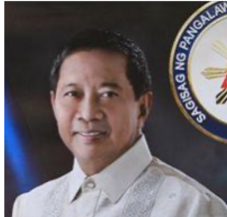
Jejomar C Binay Former Vice President