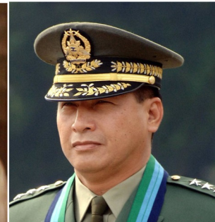
Gen Generoso Senga AFP (Ret) Former CS, AFP