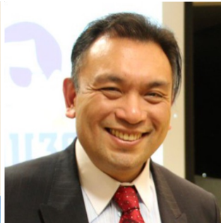
Amb Jesus Domingo DFA Undersecretary