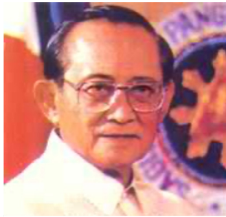
Fidel V Ramos (+) Former President