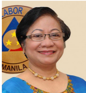
Rosalinda Baldoz Former DOLE Secretary