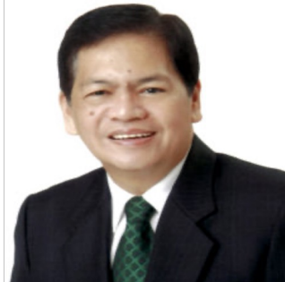
Benjamin Espiritu NDCPAAI Pres / Former Governor, Oriental Mindoro