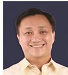
Francis N Tolentino Senator