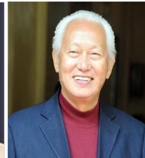
Alfredo S Lim (+) Former Senator